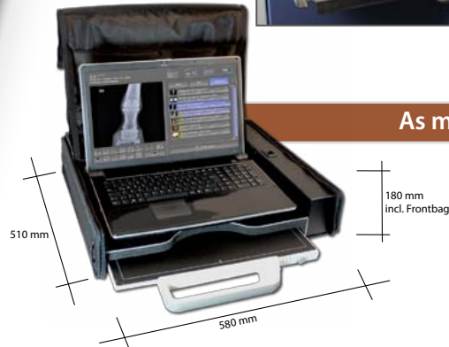
As mobile solution