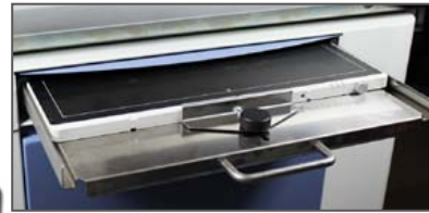
As table solution